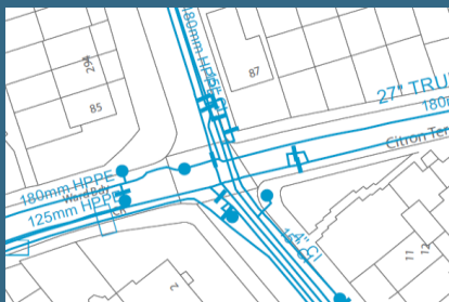
Extract of water record